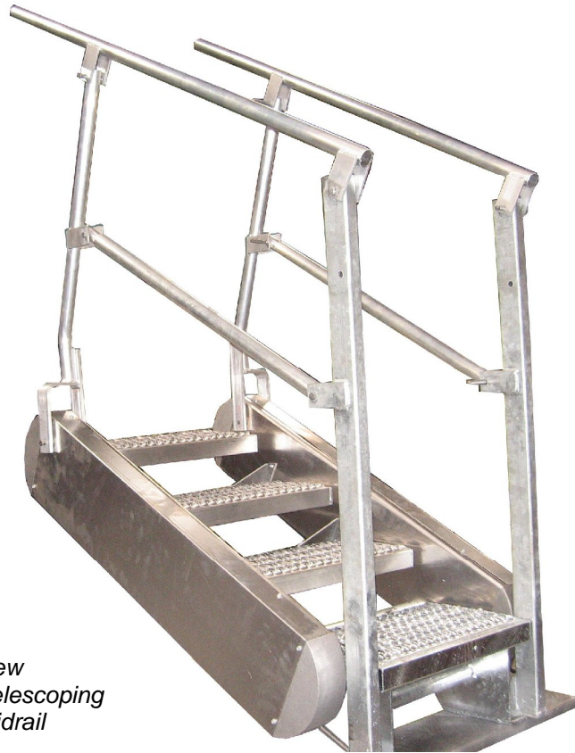
New Telescoping Midrail

Maneuvering the Safety Stair is performed by hand. Simple and compact tension spring balance method makes all movements easy. A slight push or pull positions the stair for safe access to the vehicle. Each unit is equipped with a locking mechanism for storage in the vertical position.